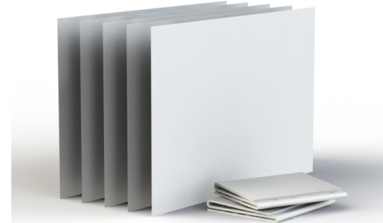
White (without windows)