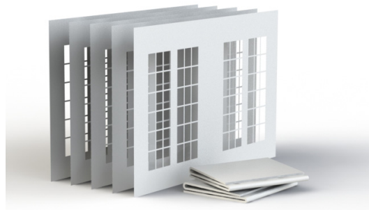
Clear French windows