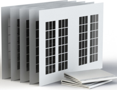
French tinted windows