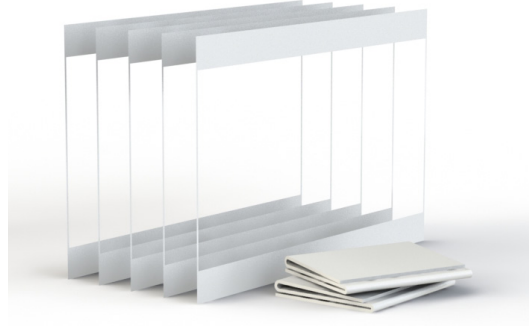
Clear panoramic windows