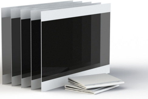
Tinted panoramic windows