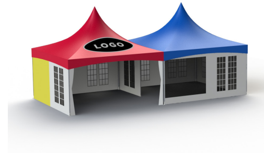
Color and print